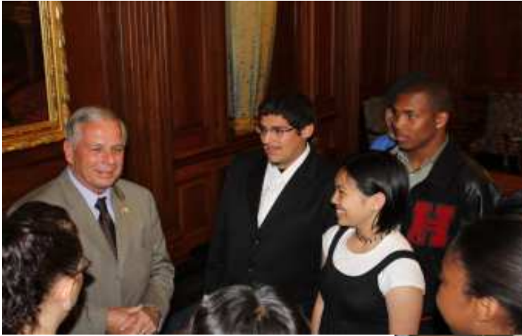
Houston Area Congressman Gene Green greeted Furr High School Students.

Students met to discuss issues and concerns with staff from the offices of Senators Kay Bailey Hutchison and John Cornyn , as well as from Representative Al Green's office . They also met with Representative Gene Green .