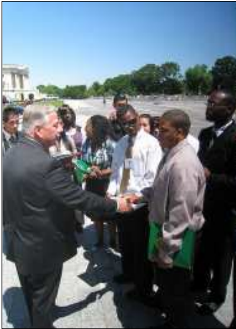
Congressman Gene Green greeted students.

While in DC, students met to discuss issues and concerns with U.S. Representatives Gene Green, Al Green, and Sheila Jackson Lee . They also met with staff members of Senators Kay Bailey Hutchison and John Cornyn .