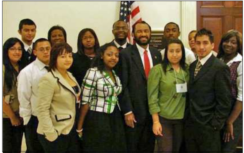
Congressman Al Green met the Furr High School students in his office.

the Institute for Civility in Government P.O. Box 41804 Houston, Texas 77241-1804